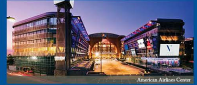
American Airlines Center

HILLWOOD ® COMMUNITIES A PEROT COMPANY Live Smart