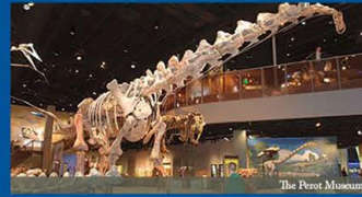
The Perot Museum