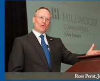
Ross Perot, Jr.